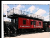
Caboose #2 Compliments of George Merrifield

CLICK HERE to view New Member Orientation - Rotary 101