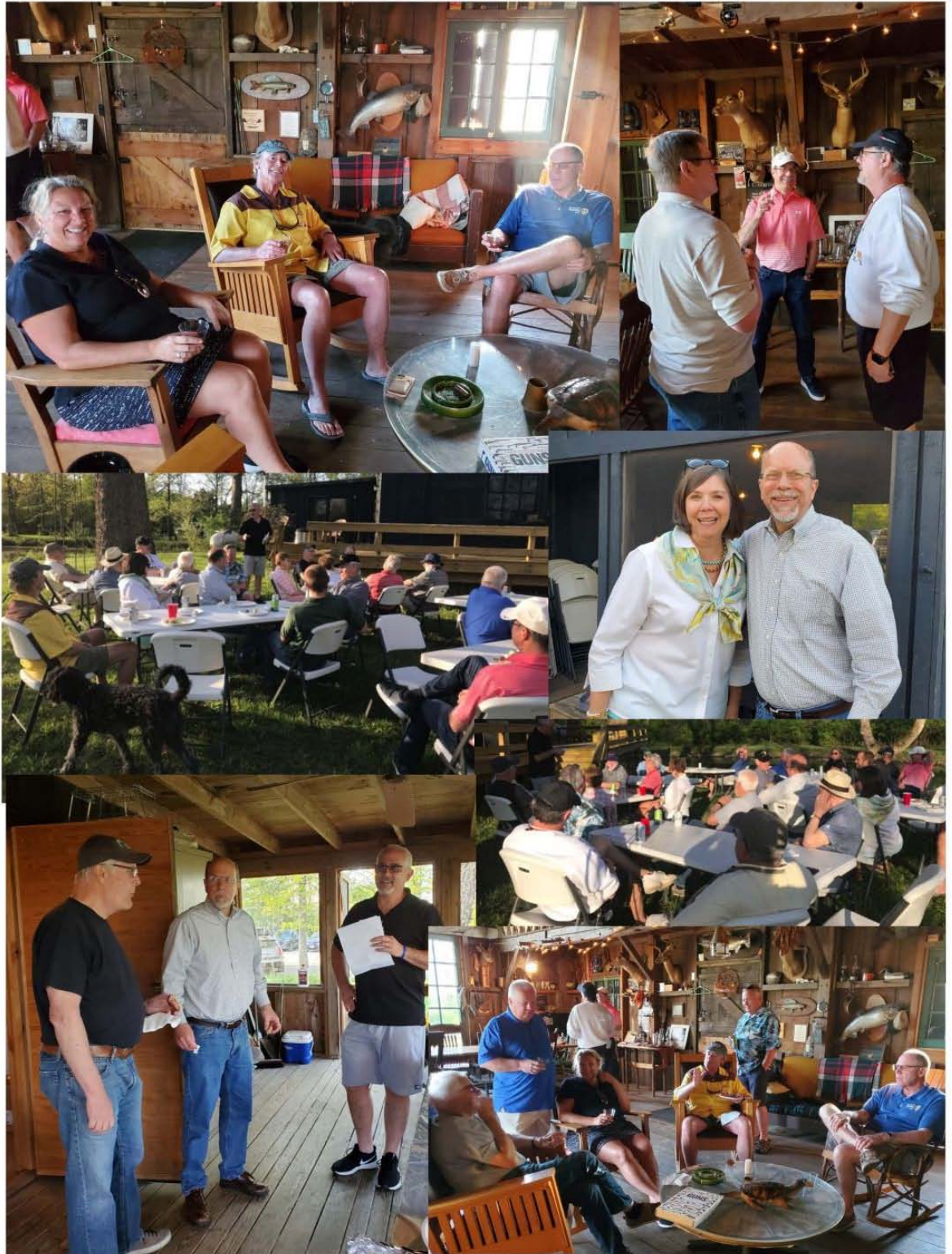
Muse Machine a Night with the Stars