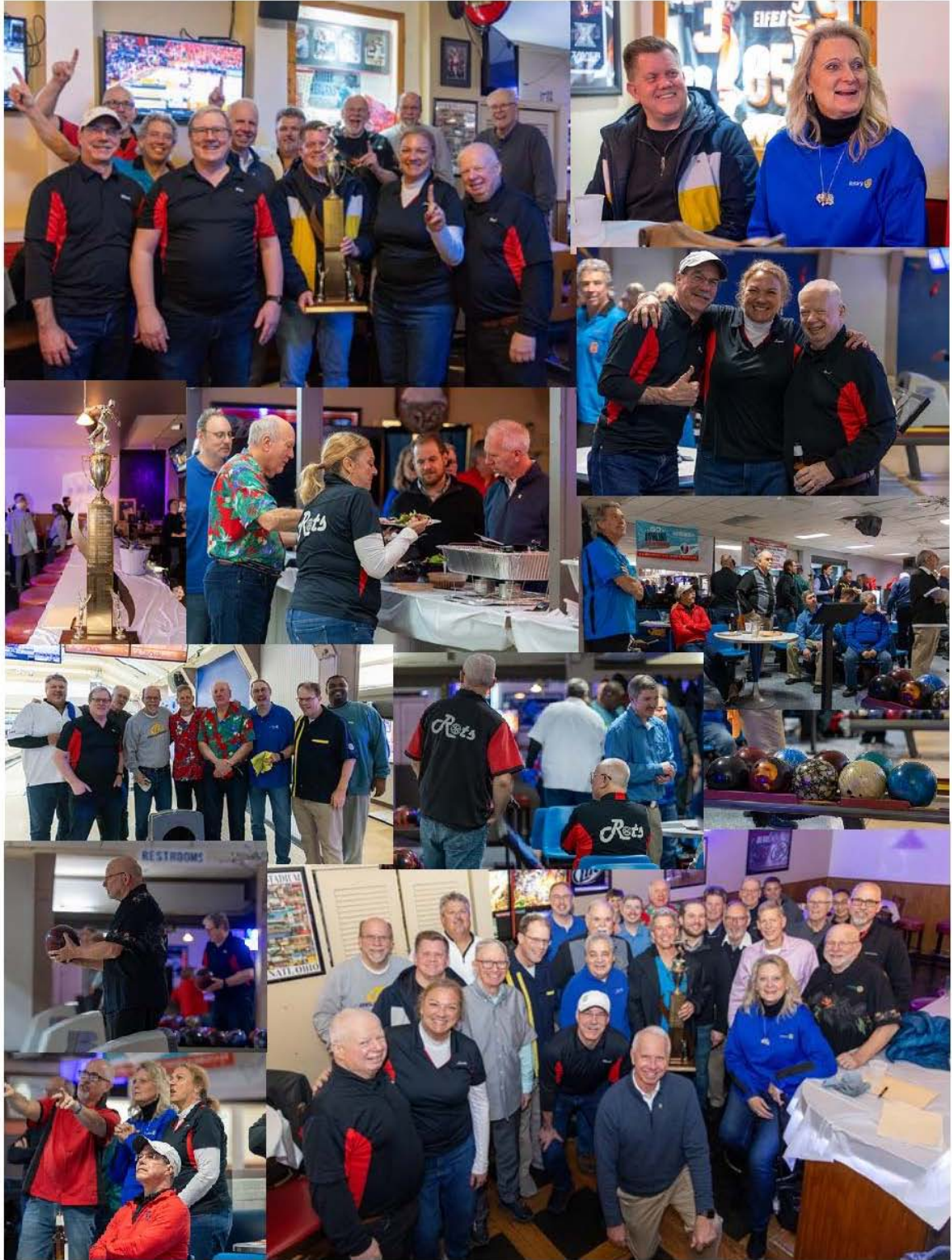
Rotary District Gala