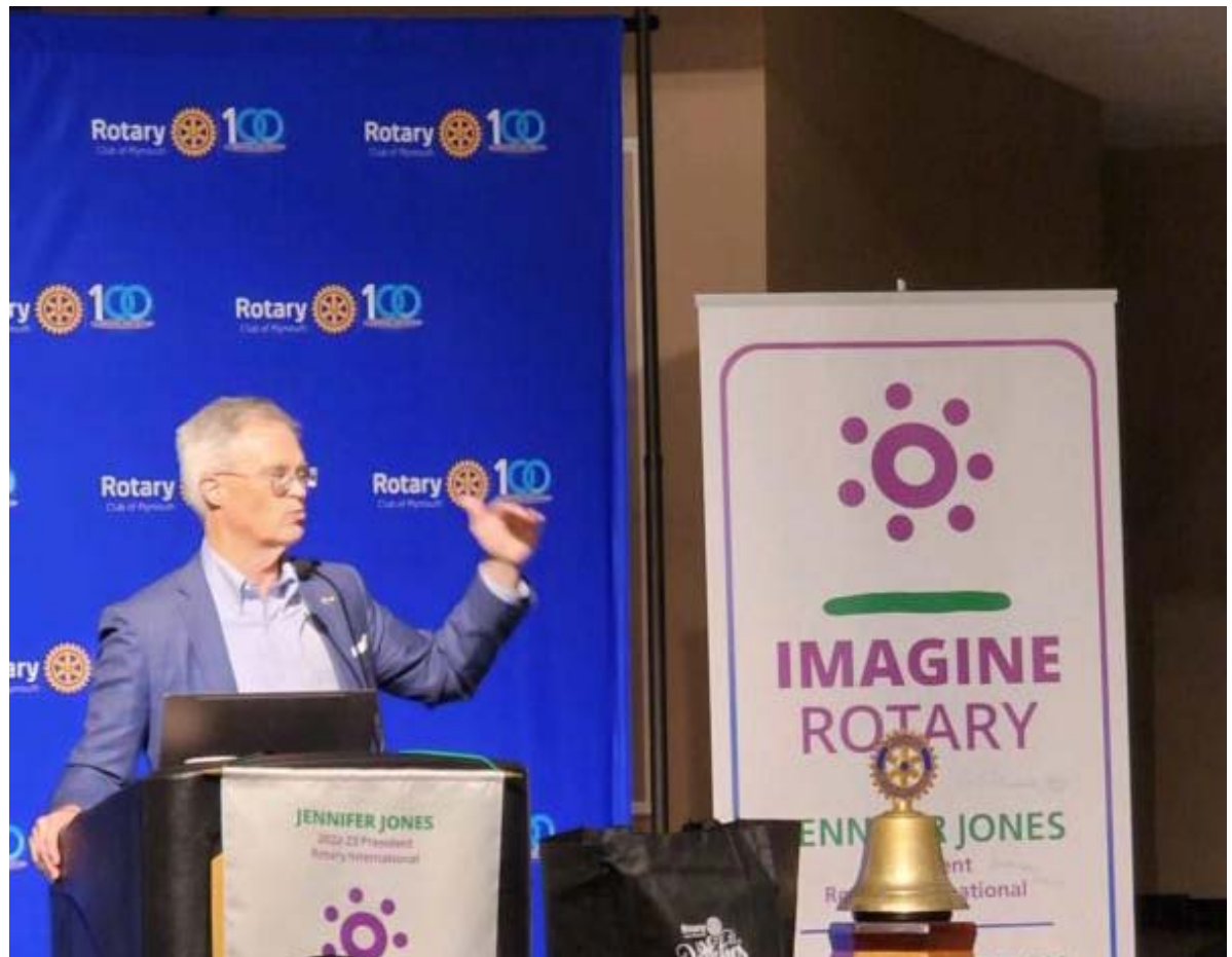
Broadcaster for September 23, 2022