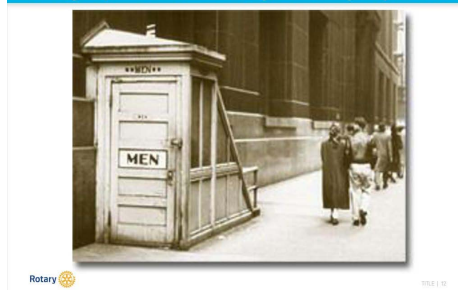
Chicago's public toilet - 1st Rotary Community Project 1907