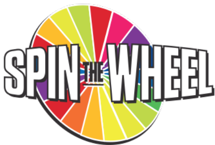
A bevy of latecomers spun the wheel and were fined.