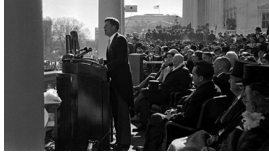
Lou Gehrig - Farewell Speech