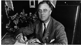
John F Kennedy - Inauguration Address