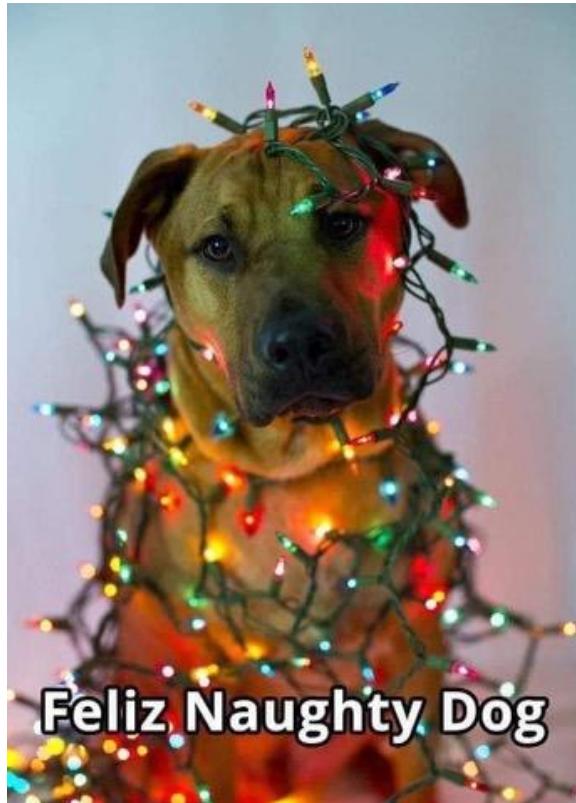
Feliz Naughty Dog

Victor has Crab Feed sponsor letters. Goal is $10,000.00.