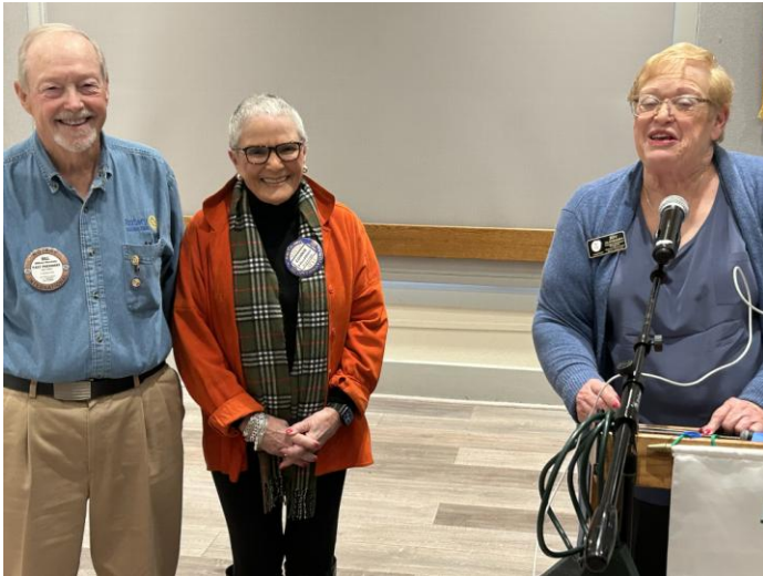
Paul Harris award recipients