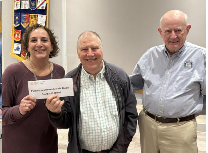
Jeha grant recipients