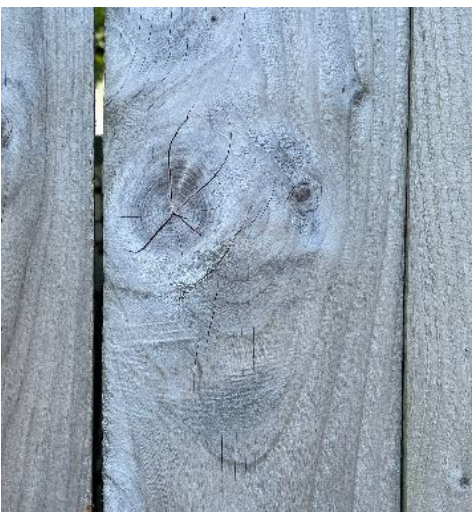
DO YOU SEE WHAT I SEE?? by Frances Vanderbeck

A great example of seeing something special in an everyday object. The monumental tractor wheel and tire dominate the photo, drawing attention to its weight, size, symmetry, and color. But the art is in the details, specifically the imperfections – especially the partially flat tire and the spots of rust. This is no showroom tractor - it works for a living. Its youthful glory days may be past, but it’s strong and still has plenty of chores ahead – a metaphor for all of us as we move through life’s many stages.