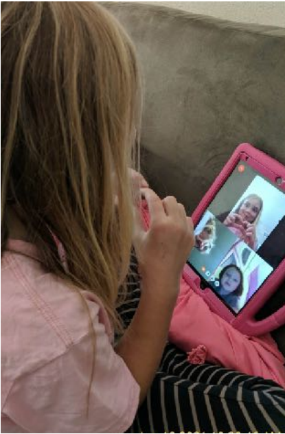
CONNECTED by Heather Gyselman

This image encapsulates the love and “connectedness” of the child with what we assume are family members on the screen, as they share the familiar heart hand gesture. Viewing this photo one can literally feel the emotions and the bond flowing between the child and the woman on the screen. It is another timely message of how love ties us together despite the separation many suffered through during the pandemic shutdown, and how despite this love finds a way to connect, in this case via technology. The message comes through - even in the depths of the pandemic, love is stronger than COVID.