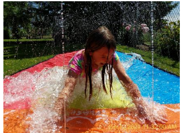
WET - Runner Up, Best in Show

The Best in Show decision was tough for me. The raw emotion and joy of life in this image is so compelling – it really draws the viewer in. I think it deserves recognition as Best in Show runner up .