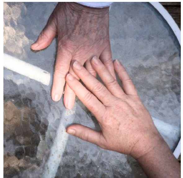
AFTER QUARANTINE by Erich Hayner

This photo captures the emotions inherent in the forced separation of loved ones across generations imposed by the COVID shutdown. The obvious age difference of the two hands (and the fact that the older hand is in partial shadow) encapsulates the joy, emotion, and intimacy we are again able to experience as we reconnect physically with those dear to us, grandparents once again hug grandchildren, and the time of COVID-imposed separations slowly fades.