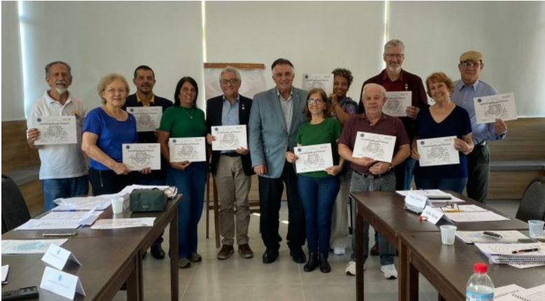
Pictured are the newest Facilitation Graduates from D4560 in Brazil. Congratulations!!

We are stronger together! Action opportunities for you: