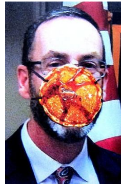
Improved Surgical Mask; Tasty, Too!