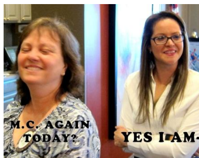
M.C. AGAIN TODAY?