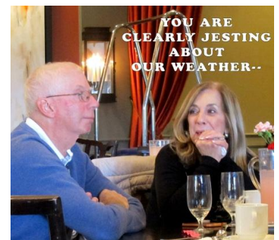
YOU ARE CLEARLY JESTING ABOUT OUR WEATHER--