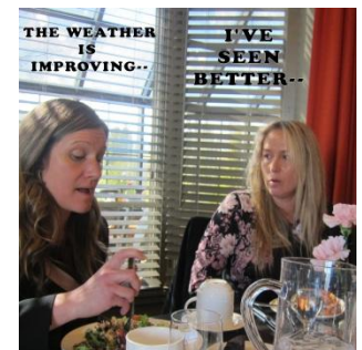
THE WEATHER IS IMPROVING--