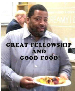
GREAT FELLOWSHIP AND GOOD FOOD!