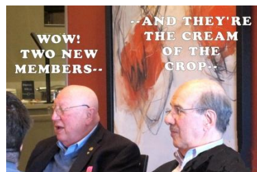
WOW! TWO NEW MEMBERS--