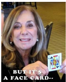
BUT IT'S A FACE CARD--