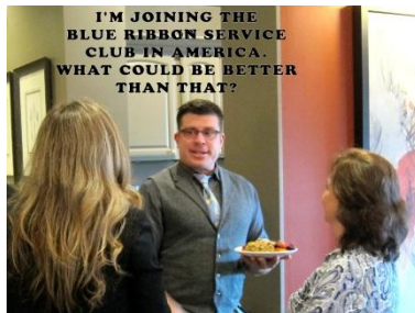
I'M JOINING THE BLUE RIBBON SERVICE CLUB IN AMERICA. WHAT COULD BE BETTER THAN THAT?