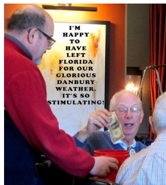
I'M HAPPY TO HAVE LEFT FLORIDA FOR OUR GLORIOUS DANBURY WEATHER. IT'S SO STIMULATING!