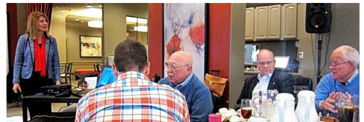
The message resonates with the club

Our speaker decided to create VOW after her own 30 years working for Non Profits. She works closely with