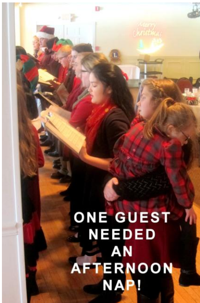
ONE GUEST NEEDED AN AFTERNOON NAP!