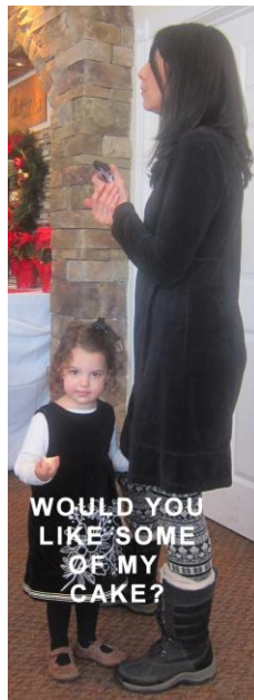
WOULD YOU LIKE SOME OF MY CAKE?