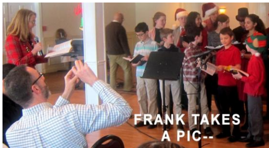
FRANK TAKES A PIC--