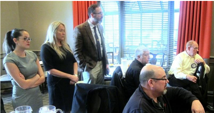
The Danbury Police Dept. had our attention--