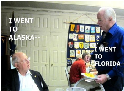
Our Rotarians are all well travelled.