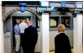
Chick Fil A Donated lunch