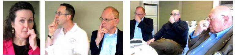
Checking out the shnoz

us more tired. Even more disturbing was her belief that breathing improperly will ultimately elongate the face, and has been related to Alzheimer's Disease.