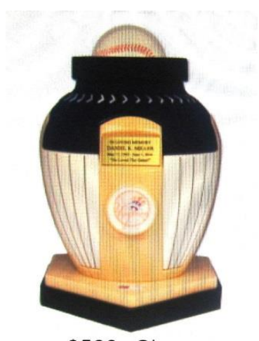
$569--Cheap at the price.

Did you know you could buy a Yankees cremation urn? Or maybe you would rather have a Boston Red Sox urn. Still my favorite is the Bud Light cremation "can." A shoebox (for designer shoes) would be cheaper and have more class, though. I wonder if there is an urn for Rotarians? A classy blue and yellow vase with a large gear for a lid, perhaps? What will they think of next?