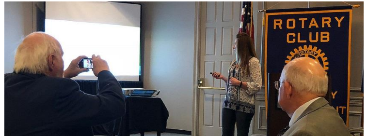
The Editor, caught in the act.