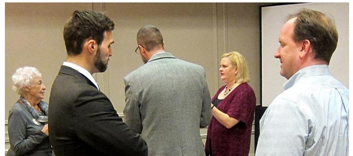
Waiting to chat with the speaker

In addition to direct patient services, Hospice provides short term inpatient care for pain management, spiritual care, respite care, and grief and