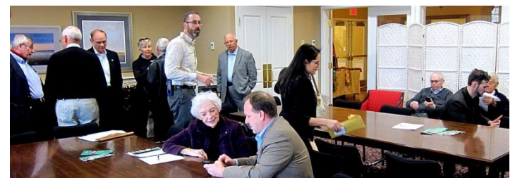
Getting ready to tour the facility

husbands, children and caregivers deal with this tragedy. Their brochure, in part, read: "Our clinical social workers, facilitators and wellness experts provide a host of services aimed