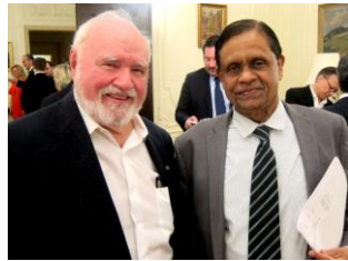
Me and Amb. of Sri Lanka