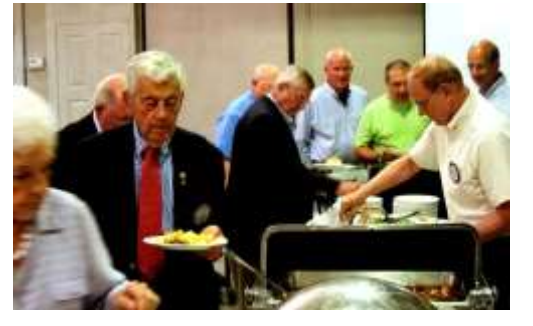
We always have great food. Potential Rotarians are welcome to our 12:15 pm luncheons.