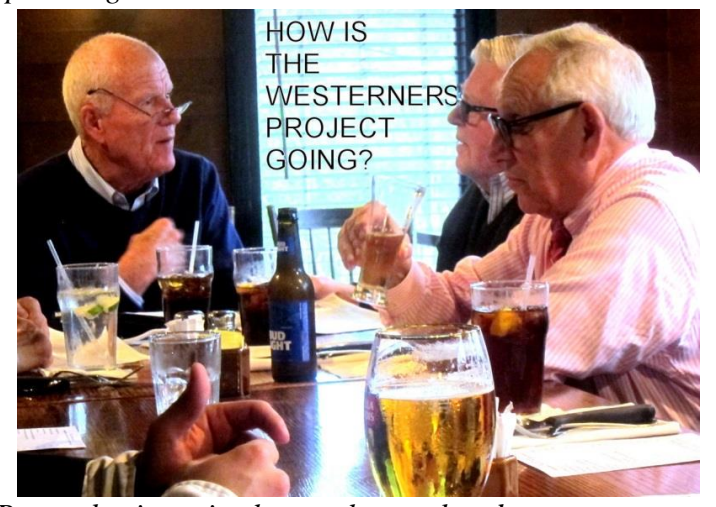
Rotary business is always close at hand.