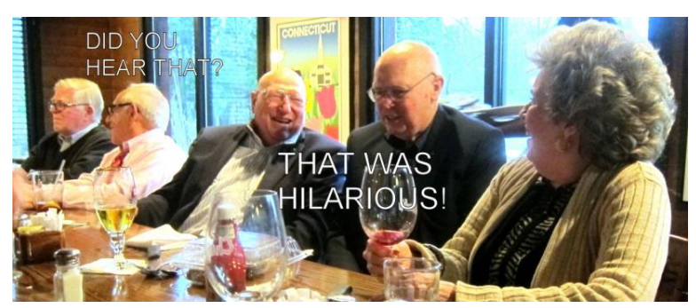
Some jokes are lame, but some are knee slappers.