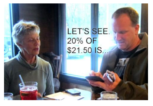
...and the bill must be paid.