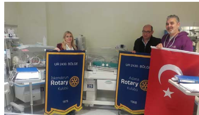
Incubator for Adana, Turkey Hospital serving Syrian refugees