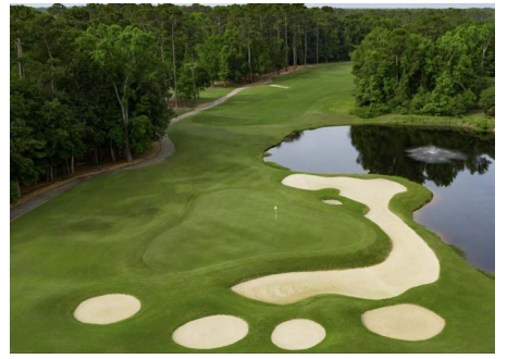
that lead to the fast and true Tif-eagle greens. Freshwater lakes of this former rice plantation and scenic wetlands provide a tranquil background to enhance your golf experience.

The CART (Coins for Alzheimer's Research Trust) program was started in 1996 when Rotarians began emptying their pocket of change at weekly meetings. 100% of all donated funds go