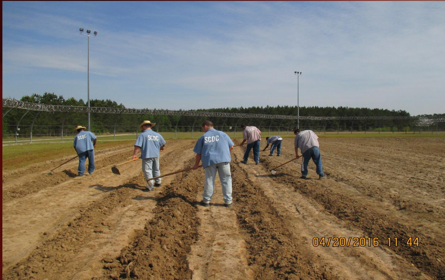
Rotaract Club members working in the community garden located on the prison yard.