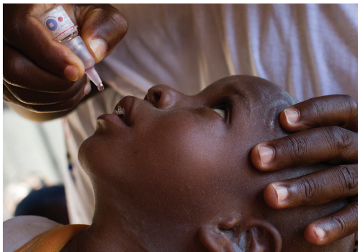
Rotarian administering polio vaccine in Nigeria, Africa

Our members’ and others’ contributions to the Foundation allow us to bring sustainable change to communities in need. Ask our club’s Rotary Foundation committee chair or visit rotary.org/donate to learn how you can support our Foundation.