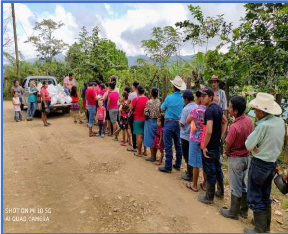
SHOT ON MI 10 5G AI QUAD CAMERA