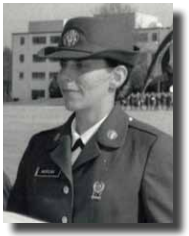
commanded units in four different countries (including being the first CSS company commander in the 2nd Infantry Division in Korea) and had two tours at the Pentagon.