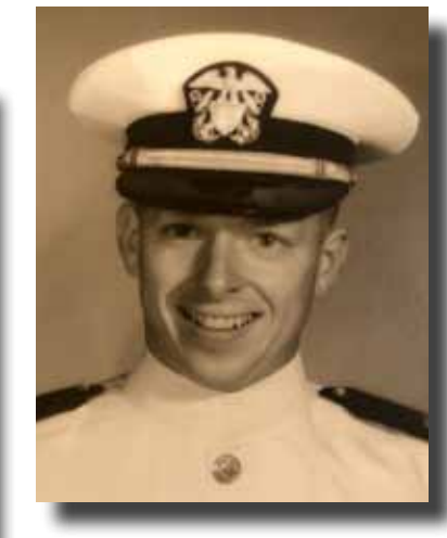
main job was performing officer of the deck bridge watches. I served active duty from 1964 through 1967.

After finishing Officer Candidate School, I served as an officer aboard a ship where we replenished the United States Sixth Fleet in the Mediterranean Sea. My