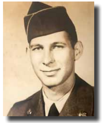
the Army, which was the highest classification they had. was an S3 corporal and served at a well-secured location.

I served for two years during the Korean War doing cryptography code work under the "for eyes only" classification for