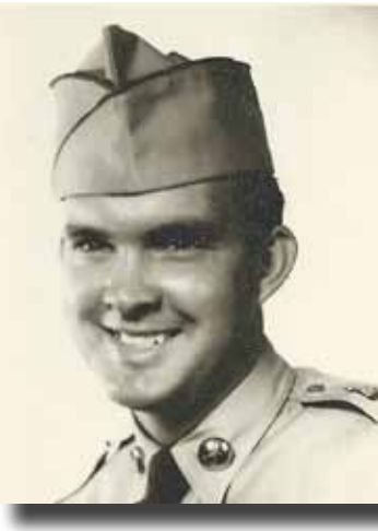
combat action in Hay Street Bars. I grew up in and around Fort Bragg and always planned to be a trooper and earn a GI bill.