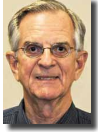
a specialty in amphibious warfare. I commanded two Navy Reserve units including an amphibious assault support unit. I served for four and a half years as a captain in the Pentagon and served on the staff of the chief of naval operations as the Navy's weapons systems integrated logistics support coordinator. I retired in 1984 after 28 years of ser-