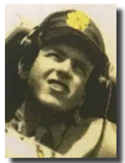
Air Force in Alaska and I was raised in Greensboro which had a large airport.

I was a captain in the Eighth Air Force, which now serves as the Air Force's Global Strike Command. During World War II, I was stationed in England and was a first pilot, flying 27 bombing missions over Germany in a four-engine B-17 bomber named Bottle Baby. I was always interested in flying. I had an uncle who served in the