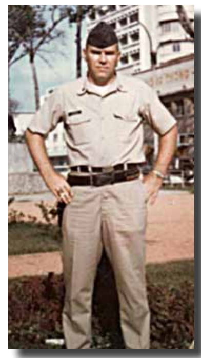
and looking out for your brothers-in-arms.

I served in the United States Air Force from 1955 to 1983 both as an enlisted man and as a public affairs officer. I retired from the Air Force Reserves as a major. I served in Vietnam in 1969 and 1970. For me, the service was all about growing up, teamwork