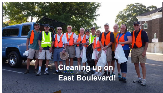
Cleaning up on East Boulevard!