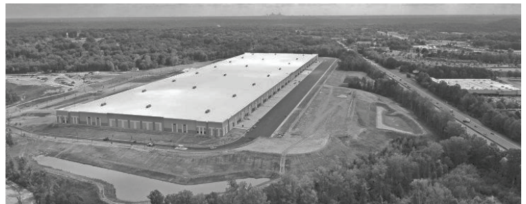
The 1.5-million-square-foot building in the Gateway 85 business park beside I-85 between Lowell and Gastonia is the Southeast distribution center for Newell Brands, a Fortune 500 company, distributing products such as Rubbermaid, Mr. Coffee, Oster, Calphalon and Sunbeam. Total investment is $135 million.

Hicks cited a massive 900-acre project on the Gaston-Lincoln border that will be a two-county joint venture. It's called Riverbend Farms and more than half of the acreage will be in Gaston