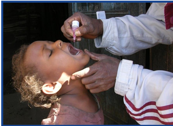
Preventable with vaccines