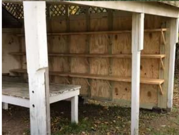
(Wall was put up as an addition to the shed for better storage)

Look for more information about a Work Weekend at Camp Fairlee coming next year in April!