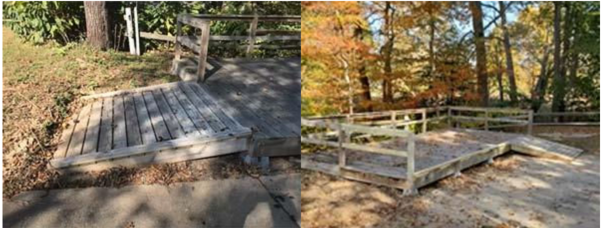
(Ramp was moved to a better location on the platform)

These are "Before and After" pictures of the Ramp, Flower Bed and Shed!