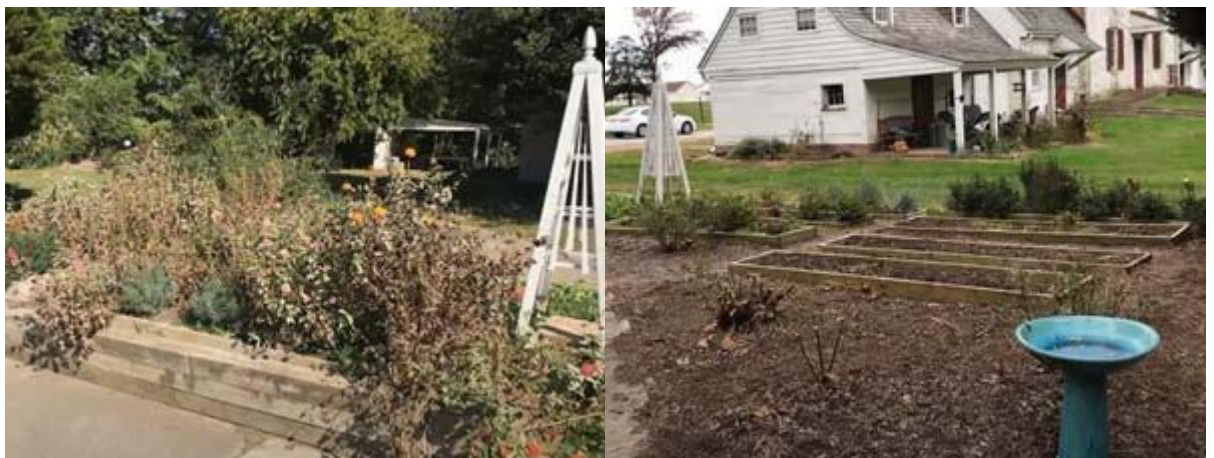
(Flower Beds were cleaned out for the winter)