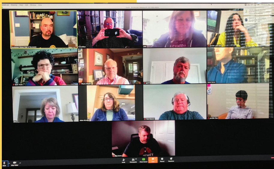
[Below] Members of the Smoketown Rotary Club conduct a virtual meeting.

The gift was a coordinated effort between the Club's Friend's in Need