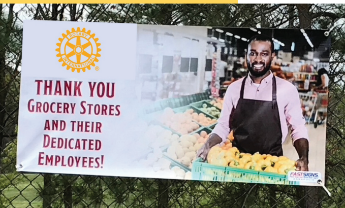
[Above] The Annapolis Rotary Club displayed banners thanking the heroes in the the community during the COVID-19 pandemic.