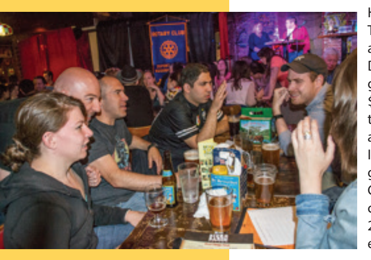
[Below] The 8th Annual Dupont Circle Trivia Fundraiser will be held on March 1.

Purchase single or team tickets online: https://dupontrotarytrivia.eventbrite.com