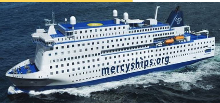
[Above] This is the largest Global Grant for the Charlotte Hall Rotary Club totaling total $1.125million! More than 300 clubs and 30 Districts have contributed $725,956 plus $400,000 from The Rotary Foundation World Fund. Mercy Ships goes back to 1978 and over the years more than 89,000 surgeries and 423,000 dental procedures were performed. They trained 40,800 healthcare professionals. Mercy Ships Headquarters was established in Texas and 15 other countries joined with their offices in their country. This ship will be equipped with 35 surgical trays, ICU ultrasound, operating room and anesthesia equipment. District 1260 Governor Mary Whitehead says "Be the Inspiration; Rotary Connects the World; Rotary Opens Opportunities." West Africa is the primary goal at this time. --Dr. Ila Shah

I am writing to share some of the recent projects our club has completed with regards to