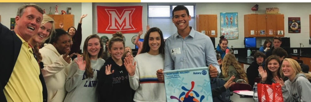
[Below] Broadneck High School Interact Club now and 15 years ago.