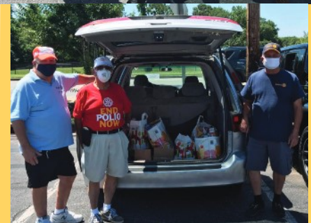
[Above] The Lake Shore-Severna Park Rotary Club held a food drive on July 14th in front of Sanders Jewelers in Pasadena for AACFB -and in 2 hours collected close to 300 pounds of non-perishable food.