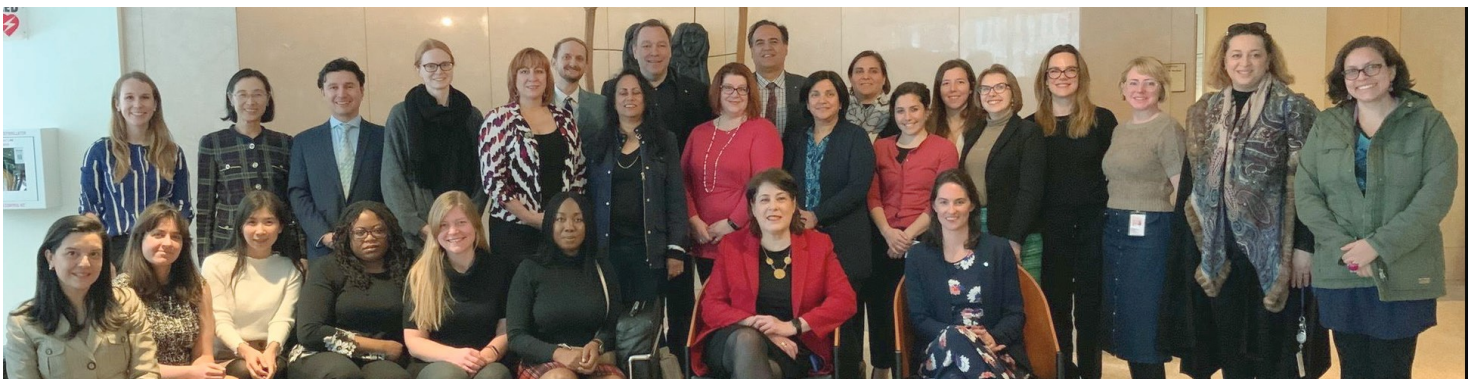
[Above] Our new club, the Rotary Club of Washington Global was chartered on February 28, 2020. We will aim to serve as a knowledge club or small “think tank” for Rotarians. Our charter members are mostly based in Washington, DC and working for international development organizations, but we welcome members from all walks of life. Apart from a core group meeting in DC, members located elsewhere in the US and abroad will be able to attend meetings online.

If you have any questions on either initiative, please do not hesitate to send me an email at rotarianeconomist@gmail.com . We will have brainstorming meetings in August on how to best proceed for those who have filled the forms to indicate their interest in joining. Then we will finalize the proposals for approval by Rotary International.