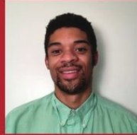
LONDON FORTONBERRY INTERNATIONAL SERVICE CHAIR