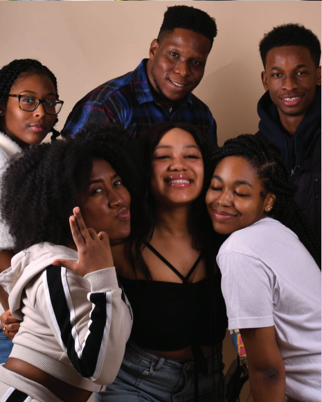
[Above] For their first event of World Rotaract Week, the HU Rotaract Club spent their morning designing cards for Little Sisters of the Poor Retirement home for their Holy Week from April 14-21. They also hosted a week full of events including an info session for prospective members and a social photoshoot.