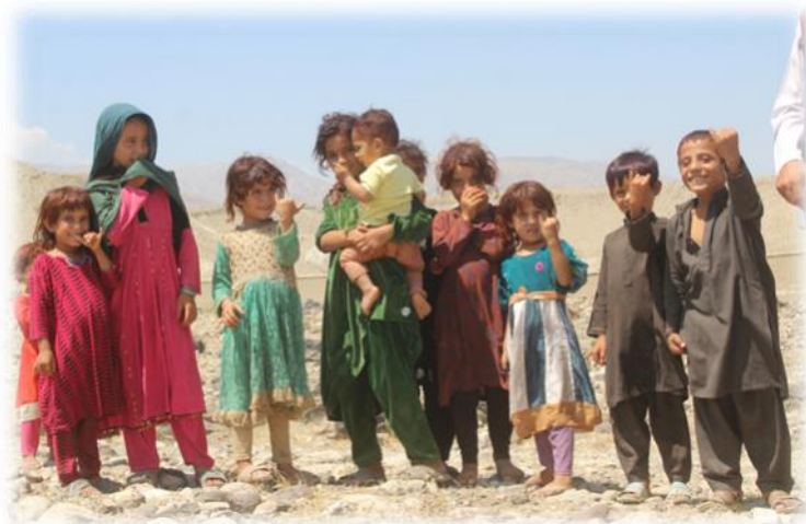
Children show their inked fingers – a sign they have been vaccinated against polio.

Leaders at this week's (6/28/2022) G7 Head of State meeting in Germany and last week's Commonwealth Heads of Government meeting in Rwanda renewed global commitment to polio eradication. In their official Communiqué, the Leaders of the Group of Seven (G7) vowed to 'continue our support for polio eradication through the Global Polio Eradication Initiative', while the Commonwealth Heads of Government, in their joint Communiqué on ' Delivering a Common Future ', urged the continued intensified effort to eradicate polio, even amid other pressing health and development issues. These calls and commitments follow similar engagements made at previous global political fora this year, notably the recently-held G7 Development and Health Ministers meeting , and the World Health Assembly .