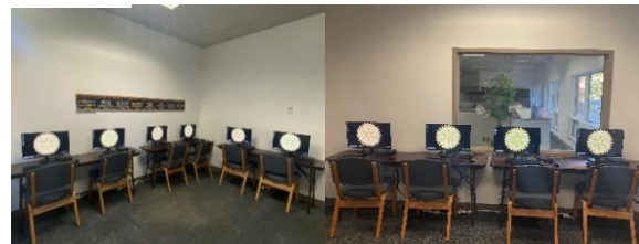
The lab consisting of 10 computers