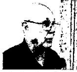
Also won the mini-affle