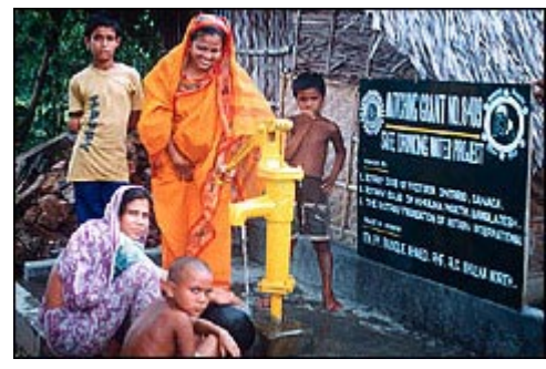
A Rotary Foundation Matching Grant brought clean drinking water to this small villiage.

The Foundation's Humanitarian Programs fund international Rotary club and district projects to improve the quality of life, providing health care, clean water, food, education, and other essential needs primarily in the developing world. One of the major Humanitarian Programs is PolioPlus, which seeks to eradicate the polio virus worldwide. Through its Educational Programs, the Foundation provides funding for some 1,200 students to study abroad each year. Grants are also awarded to university teachers to teach in developing countries and for exchanges of business and professional people. Former participants in the Foundation's programs have the opportunity to continue their affiliation with Rotary as Foundation Alumni.