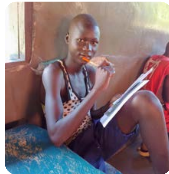
Mogga - 14 years old