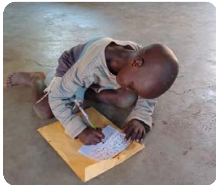
Lodi Gai - 6 years old

Loki, Tomba, and I left Terekeka in the Land Cruiser at 7:00 am and returned at 4:00 pm - travel-worn from hours on rain-swollen roads, but having had a profitable time at two Bush schools - Gwele and Burrungga. We assessed the abilities of the "Learners," and have developed a plan to provide training/direction to these largely untrained teachers to help them be more effective. These visits are always "eye-opening" as well as fruitful, and lest I neglect to mention - enjoyable!