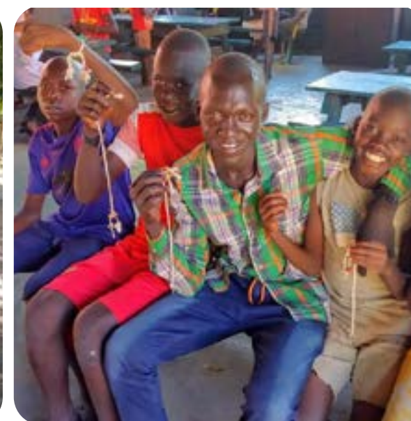
Craft for the day - Bible bookmarks - idea and materials from Amy Rose