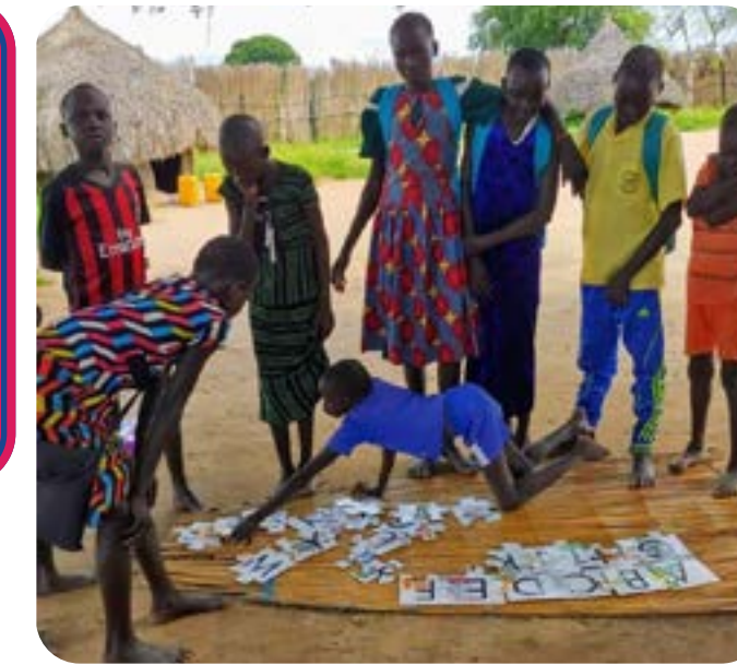
First time putting puzzles together