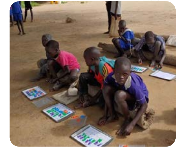
Alphabet trays in use at Burrungga