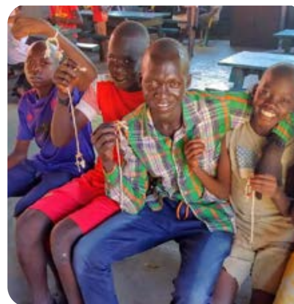
Craft for the day - Bible bookmarks - idea and materials from Amy Rose