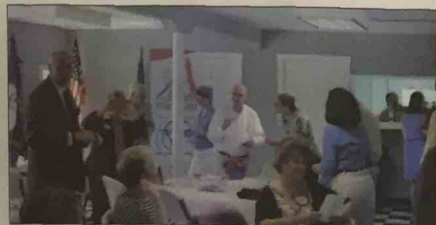
Prince George Rotary Club members and community members congregate after their meeting.