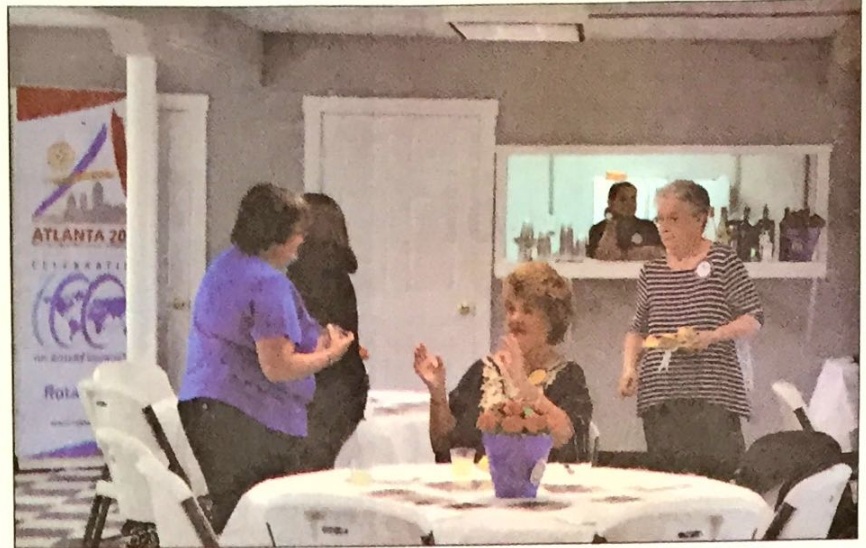
Club members enjoy tie together as they celebrate their anniversary.