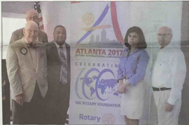
Speakers and representatives for the Rotary Club celebrate the local organization's 20th anniversary.