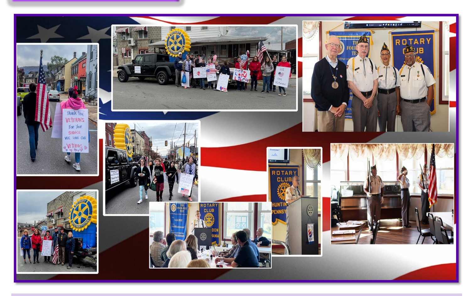
It was GREAT to be a <u>Huntingdon Rotarian</u>, and <u>Interactor</u> as we honored our Veterans.

It started with the Veterans Day parade with our Interact Club building a float and winning second place! They also learned a lot about what it means to honor our Veterans.