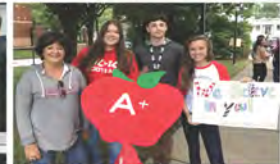
NOW A RED CARPET WELCOME! VOLUNTEERS WELCOME STUDENTS BACK TO THEIR SCHOOLS